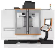
GF Micron VCE 1000 Pro