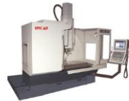
VMC STROJTOS 60