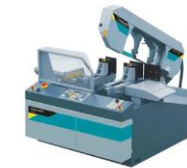
PEGAS 235x315 A-CNC