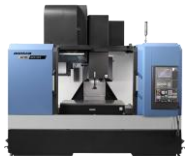
DOOSAN DNM 650