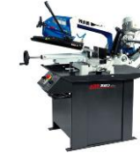
PILOUS ARG 220 PLUS