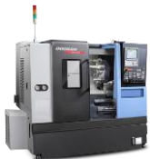
DOOSAN LYNX 220