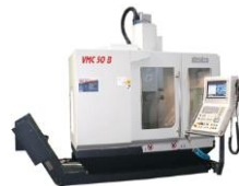
VMC STROJTOS 50