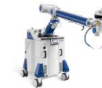
Alpha Laser ALM 300