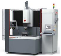
EXERON EDM 313