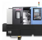
DOOSAN GT 2100M